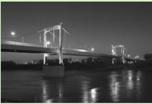
"In 1954 the Paseo Bridge opened to much fanfare for its design." (www.kcur.org)